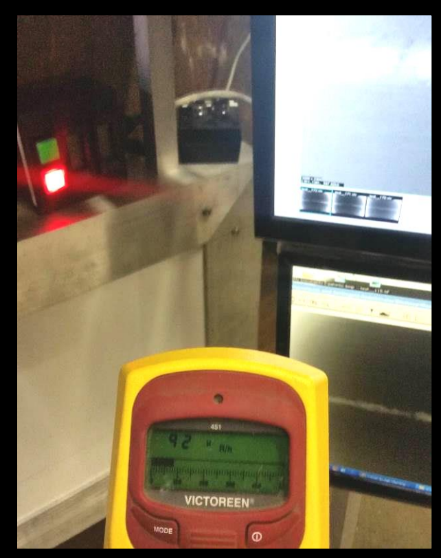
92 μR/hr at the operators station within 12in of the weld face

Worker Safety while maintaining an environment where workers are not worried about receiving radiation doses provides a new aspect to "low-dose" radiography operations. Working next to an x-ray system and panel was previously impossible and Radiographers would be required to be working with a certain level of radiation and the radiation dose was always considered a necessary evil. TruTank DR systems now allow workers to be adjacent to the tube, panel or control system for direct monitoring in fields of less than half the regulation limit. The operator can safely ride with the scanner in a weldbuggy style carriage. The technician evaluates weld images as it travels for quick results and minimal impact on construction schedules. Radiation boundaries are not required beyond the buggy envelope as the dose levels are far below the regulation levels. Welding carts or erection operations can continue to be working adjacent to the scanner buggy without restrictions.